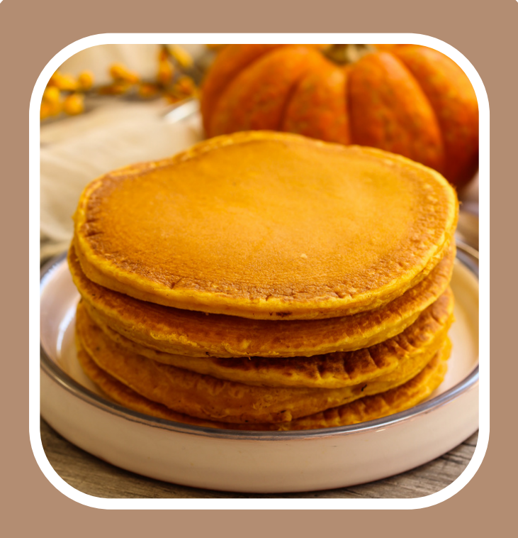
What is your favorite Thanksgiving meal? Would you prefer breakfast, lunch, or dinner?