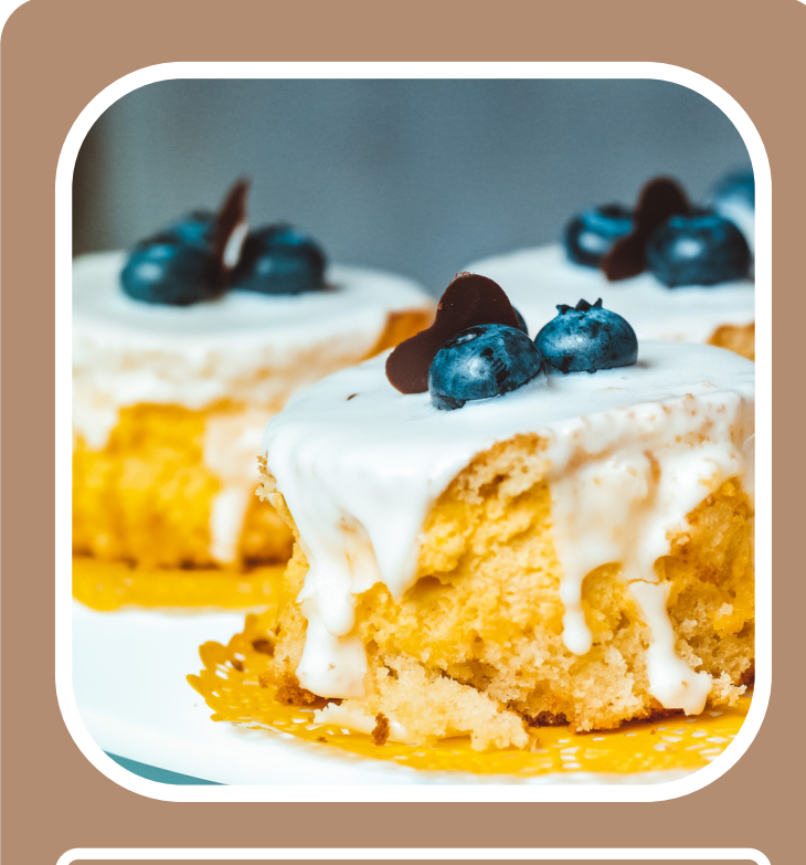
What is your Thanksgiving guilty pleasure?