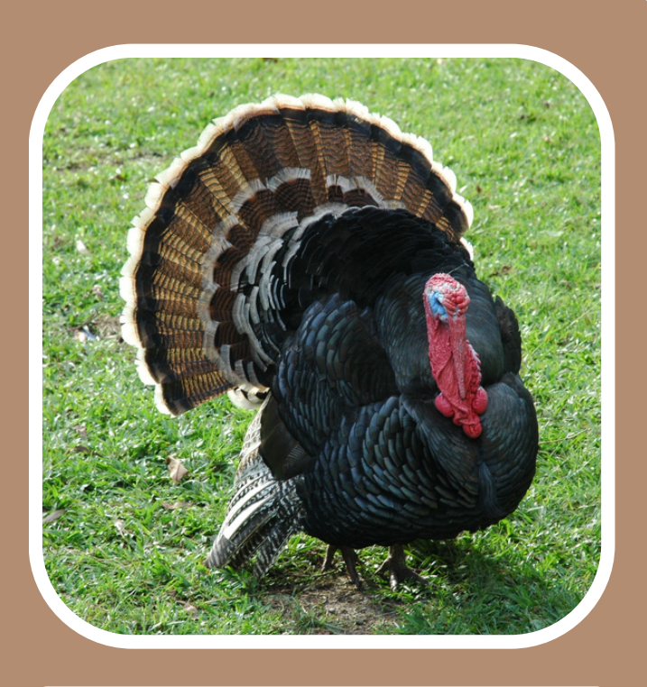
Would you rather slaughter the turkey eaten at Thanksgiving or live with it for a week before eating it at Thanksgiving dinner?