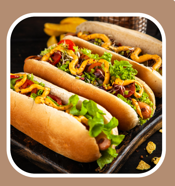
If we couldn't have turkey this year, what meat would you replace it with?