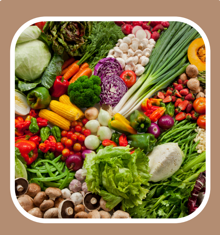
If you were a vegetable on this table, which vegetable would you be and why?